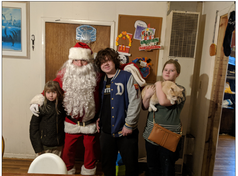
Parade of Lights and Hayride was fun for all!