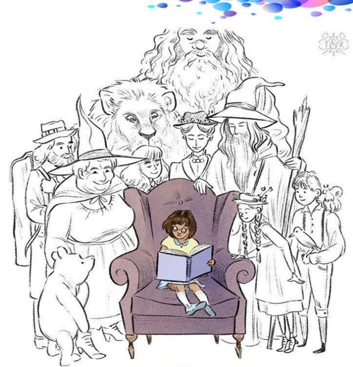
IT TAKES A LIBRARY TO RAISE A CHILD

Code Enforcement Evening office hours are Tuesdays from 6:00-8:00pm. Complaints can be filed then or at City Hall during regular business hours.