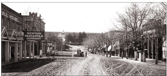
Weston Public Library Photo Archives

The Weston, Oregon Public Library Photo Archive contains about 413 photo images, 7 maps, and 60