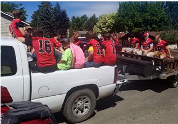
The Tigerscot Football team volunteered to help with traffic control during the parade for the 2018 Pioneer Picnic and then they picked up benches along the route too.