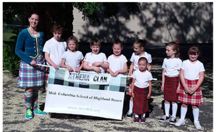
This group of young Highland Dancers joined us for the Parade and then gave a great performance on the pavilion stage later in the afternoon.